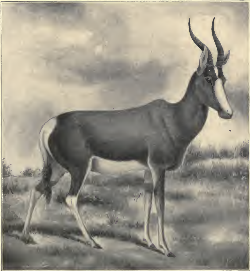
FIG. XII. DAMALISCUS PYGARGUS. BONTEBOK.